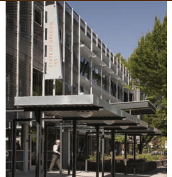
EUGENE STATE OFFICE BLDG. ARCHITECT: PIVOT Architecture

The Co-op is a family-friendly housing community with strong ties to their Whiteaker neighborhood; it is a limited equity cooperative geared as a transitional opportunity for low-income people who are either severely under-housed or without housing.