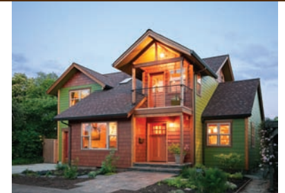
REINHART / GRAY RESIDENCE ARCHITECT: Nir Pearlson

Designed as a prototype, some key goals for the project include providing a welcoming environment that encourages learning; the integration of energy saving features that serve as learning tools; and creating a social center for the community.