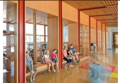
THURSTON ELEM. SCHOOL ARCHITECTS: Mahlum & Robertson Sherwood Architects, PC

The 100-year-old downtown commerce building was nicely transformed into law office suites and common areas. The design maximized daylight as much as possible for the six law offices along the north wall.