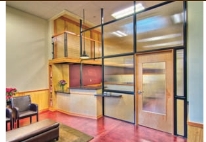
DUVALL LAW BUILDING ARCHITECT: Nir Pearlson

A sun filled house in the woods. The design maximized solar orientation, and includes domestic hot water & floor heating system with sloped Structural Insulated Panel roofs. The S.I.P.s are used as a thermal mass and storm water management system.