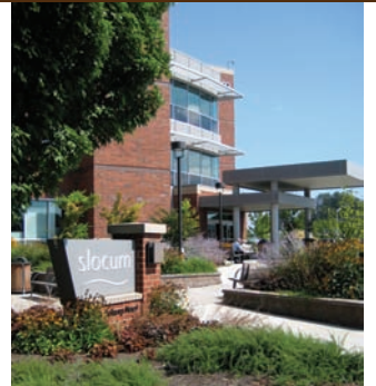
SLOCUM CENTER LANDSCAPE ARCHITECT: Cameron, McCarthy Gilbert Scheibe

Prior to renovation, the building was a nondescript structure in downtown Eugene. The design sought to transform the dated structure into a contemporary office building, providing pleasing work environments utilizing sustainable strategies.